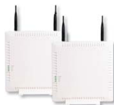
Test Cell Or Network