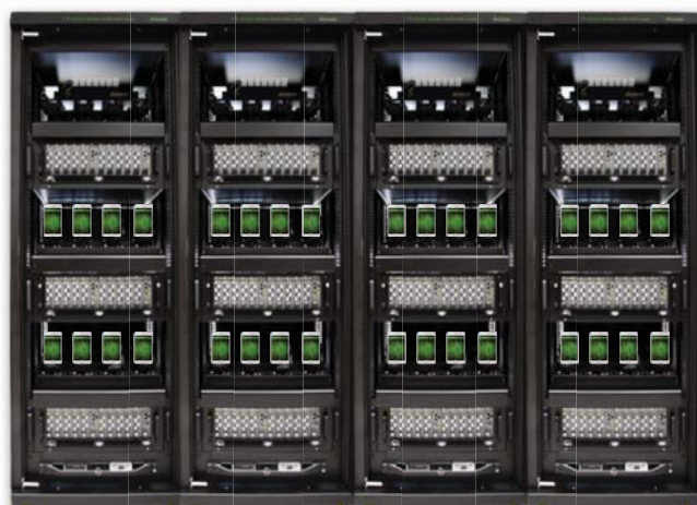
MTS Full Rack